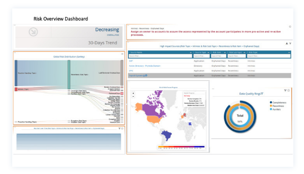
Dashboards provide real-time insight into risk trends and suggest actionable steps to improve security posture.

RSA Governance & Lifecycle Advanced Dashboards provide real-time analytics, surfacing high-priority vulnerabilities and recommending actionable steps to address them. By delivering actionable insights, the dashboards enable businesses to shift from reactive to proactive risk management, significantly reducing the likelihood of cyberattacks.